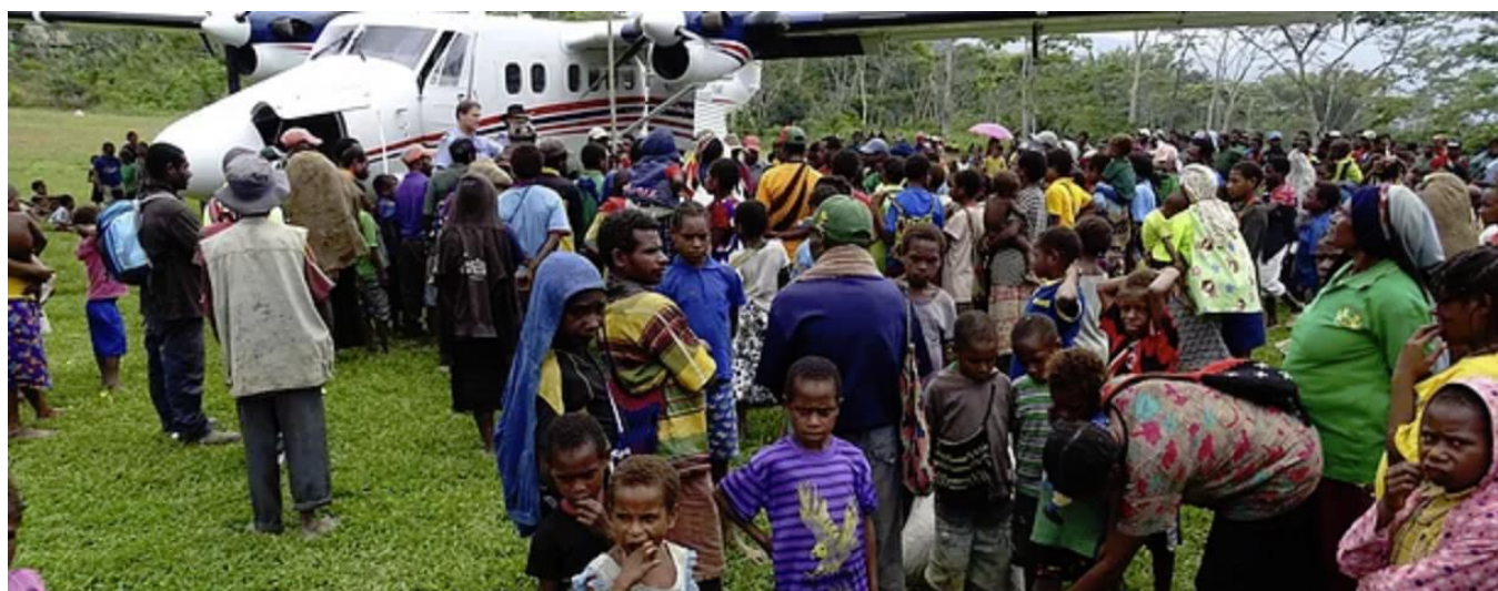
Relief supplies arrive with Mission Aviation Fellowship flights to remote areas of Papua New Guinea