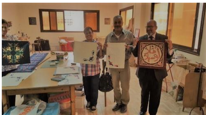
VOCATIONAL SCHOOL IN GIZA, EGYPT EQUIPS VULNERABLE YOUTH

For further information on the Code please refer to the ACFID website at www.acfid.asn.au , or see here