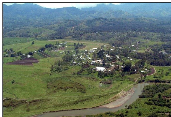
CHRISTIAN LEADERS TRAINING COLLEGE, PAPUA NEW GUINEA